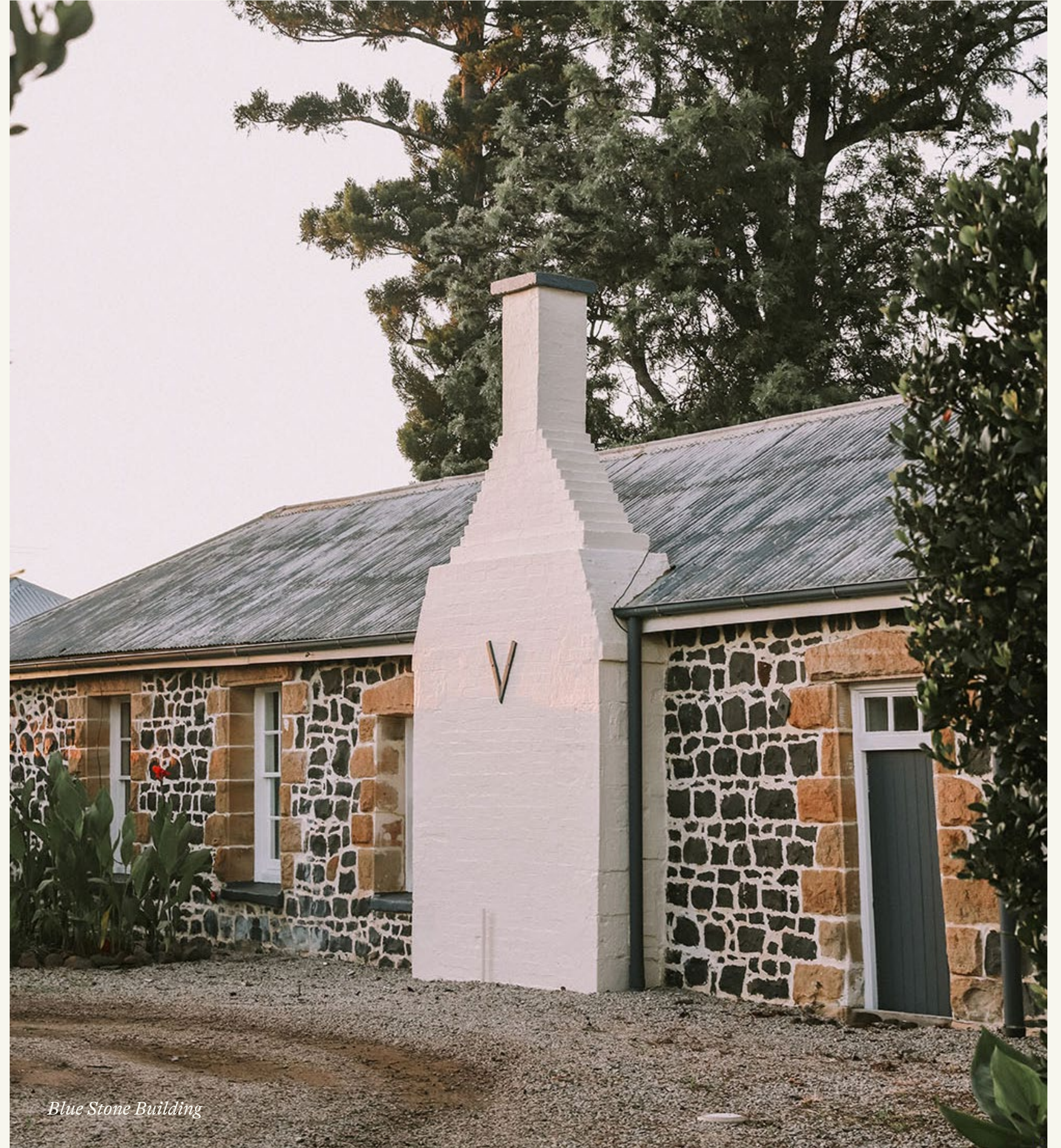
Blue Stone Building