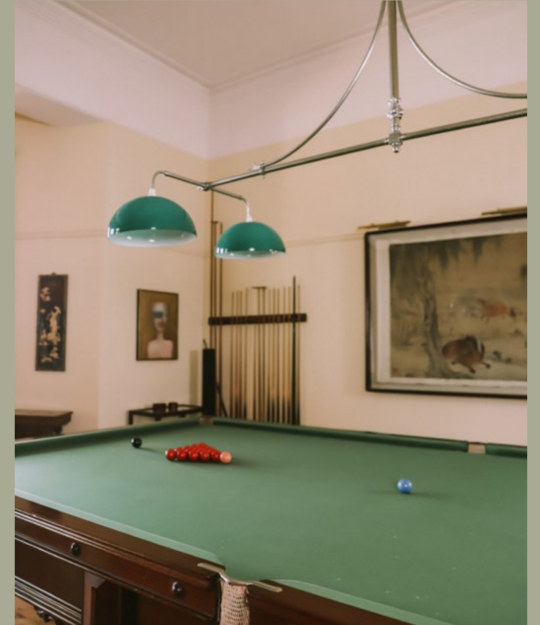
The Billiard Room