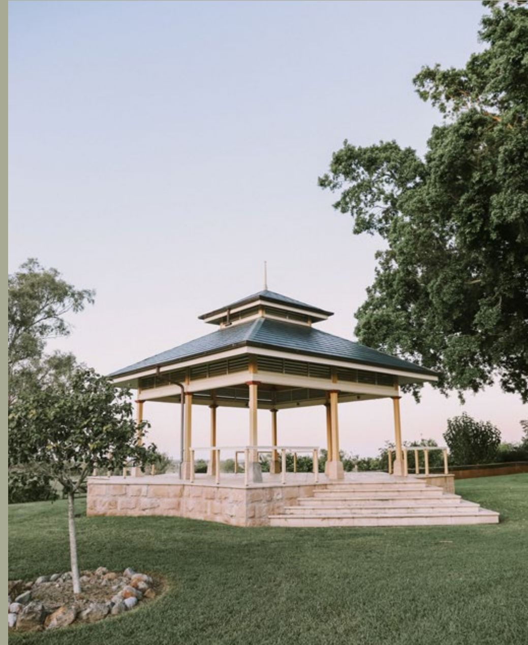
The Summer House